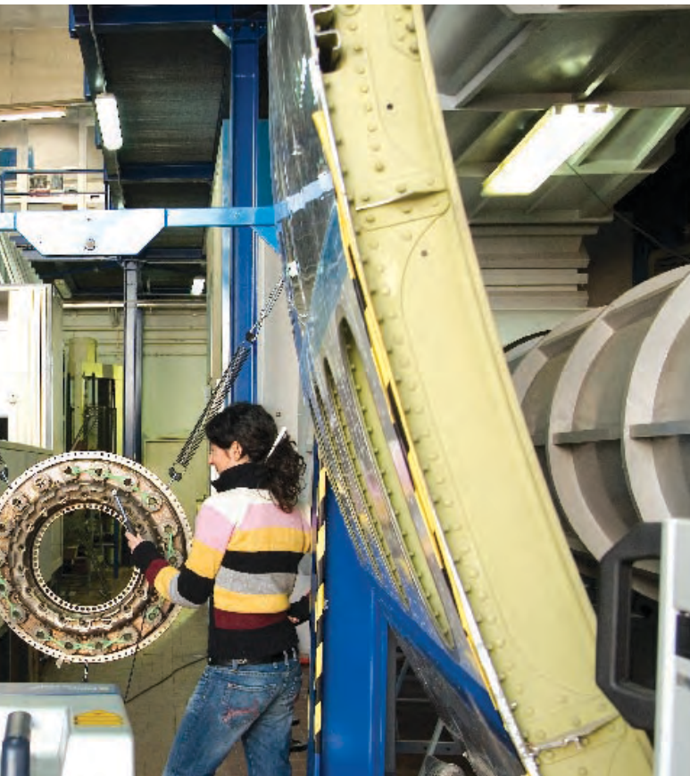
IDRA PHOTO PRODUZIONI PHOTO