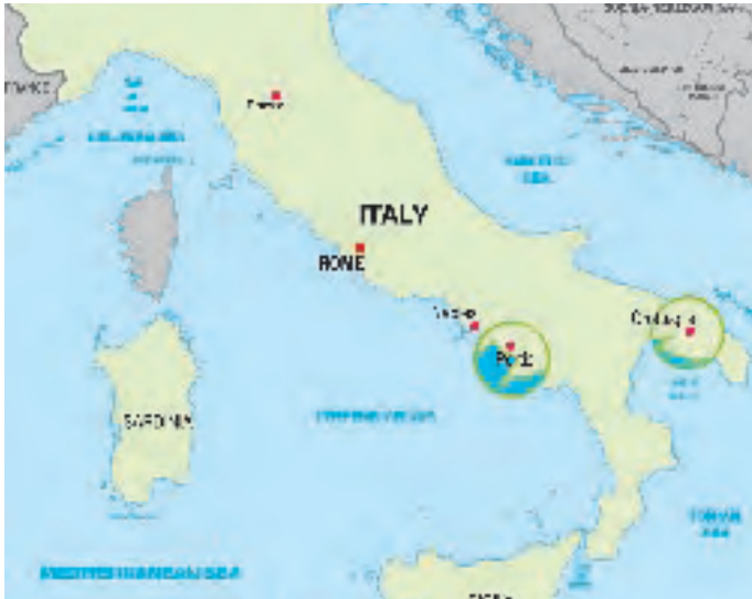
Government officials in southern Italy are keen on strengthening the high-tech skill base in the region of Campania, where Naples and Portici are located. It's also true in Puglia, where Alenia is building key 787 Dreamliner elements in Grottaglie.

Force purchase of four KC-767A Tankers (Italy was the tankers' international launch customer).